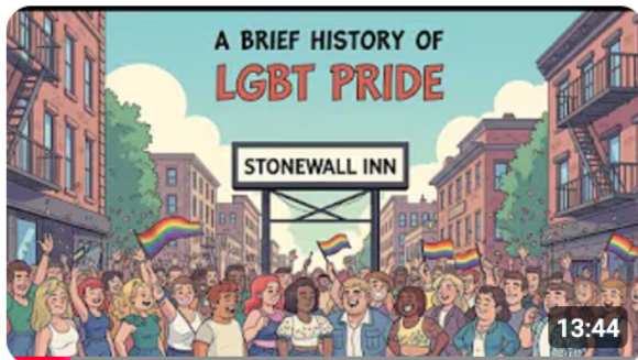
A Brief History of Pride

So, mark your calendars and come and see us and all the other amazing things at FR Pride on July 26th. Come out and celebrate with us and Be Proud of Who You ARE!